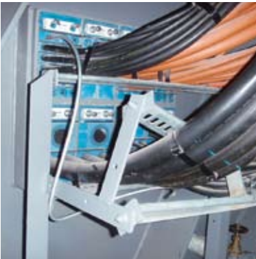
Example of multiple cable seals from Roxtec for safe routing in a marine LNG environment.