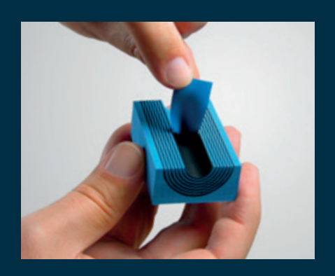
Roxtec Multidiameter™ is an innovation for flexibility based on removable layers.

Roxtec ensures a perfect fit, regardless of the dimension of the cable or pipe. Our unique solution simplifies design, installation and inspection. Avoid surprises onsite due to late changes and reduce the number of inventory items. The spare modules are always ready for upgrades and to handle high cable and pipe density.