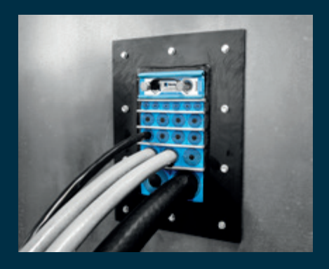
With only a few parts you get a strong reliable barrier securing operational performance.