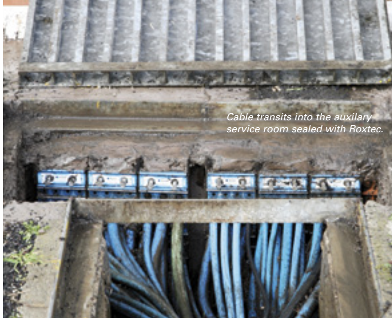
Cable transits into the auxiliary service room sealed with Roxtec.