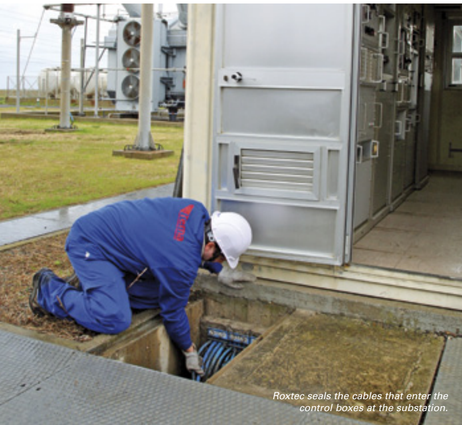
Roxtec seals the cables that enter the control boxes at the substation.