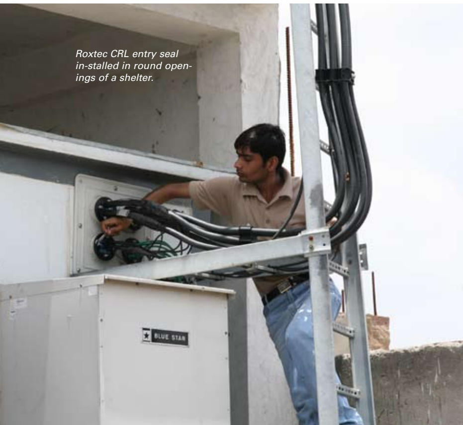
Roxtec CRL entry seal in-stalled in round openings of a shelter.