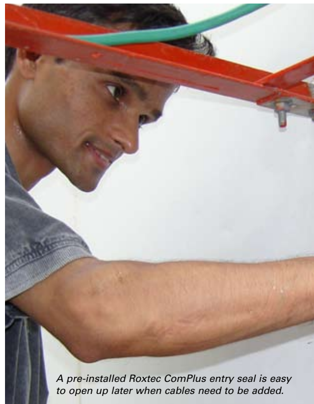
A pre-installed Roxtec ComPlus entry seal is easy to open up later when cables need to be added.