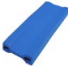
TSL 50x18 Sealing Strip ATS0000181000

TSL sealing strips for use with flanged frames.