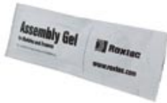
Assembly Gel Bag 10 ml ALT0000005000