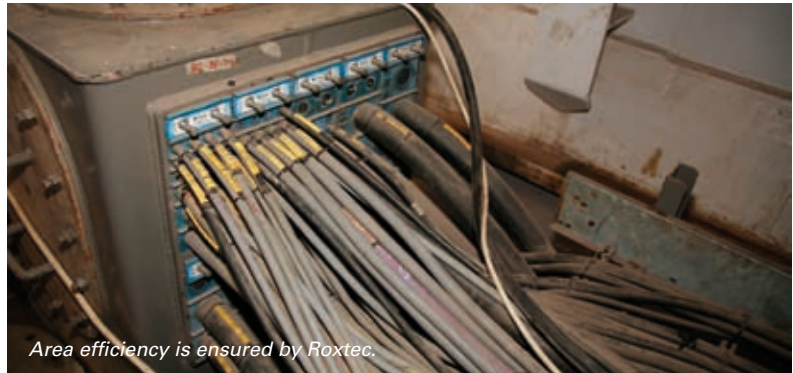
Area efficiency is ensured by Roxtec.