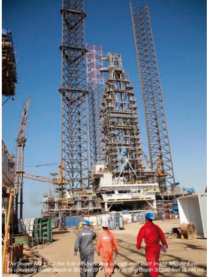
The Super M2's are the first offshore jack-up rigs ever built in the Middle East. Its operating water depth is 300 feet (91.4 m), its drilling depth 30,000 feet (9,144 m).

“ I decided to go on with Roxtec to be able to get quick deliveries