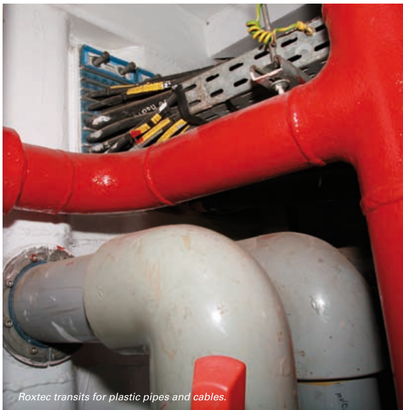
Roxtec transits for plastic pipes and cables.

The design engineers at MIS find the Roxtec Transit Manager software a useful tool for planning transits.